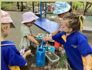
Taking an interest in how things grow supports our commitment to sustainability and care for country