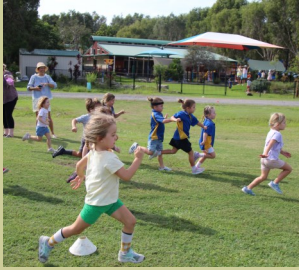
Becoming part of the college community as we join them for cross country