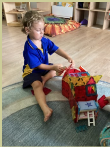
What amazing buildings our children create with the ever popular magnetic tiles