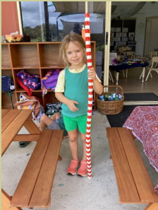
Taking pride in our achievements, comparing size and pattern making are just a few of the skills used to make this tower