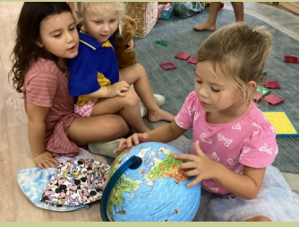
Learning about our wider world