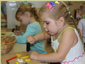
Hammering these shapes with tacks takes fine motor skills, hand eye coordination and great determination