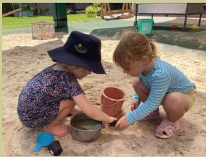
Making friends as we investigate together