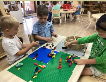
Sharing ideas as we build with our new leg set