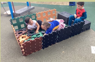
Using our imagination and large muscle skills to build a swimming pool

We take pleasure in seeing children enjoying books throughout their day as they: