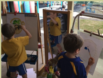
Studying our faces and painting our portraits using charcoal developed our sense of self and fine motor skills