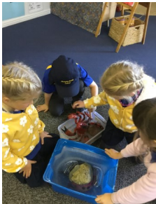
Science discoveries with ice fossils