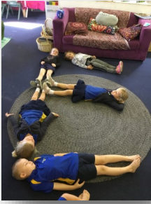
Working together as we use our bodies to make letters.