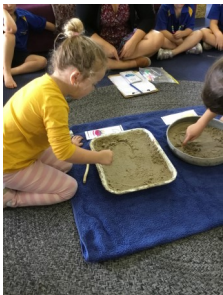
Mark making using a variety of media