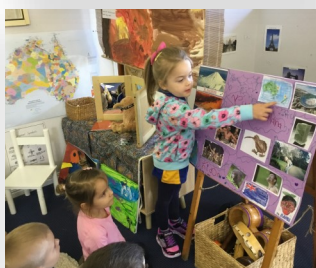
Amity proudly shared her family's connections to New Zealand