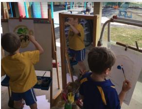
Studying ourselves in the mirror and painting our portraits as we develop our identity and sense of self