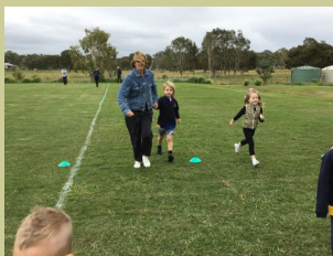
Joining the college for cross country