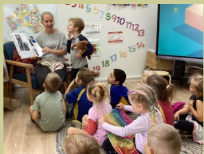
We've been very interested to learn about all the adventures "Recycle Roo" has had when visiting our Wattle friends.