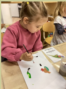
Taking great care painting pictures of the birds we spotted on our nature walk