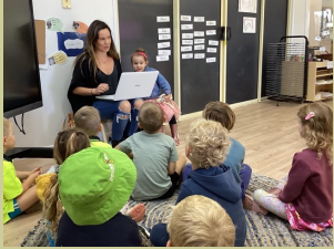
Many thanks for taking part in Wattle's focus child time when we were learning about occupations