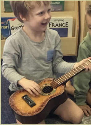
Exploring our musical instruments