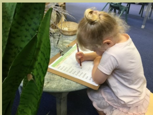
Signing in when we come to Kindy supports our literacy skills and sense of belonging

This term we have been reviewing our media and technology policy. The use and kinds of technology available has increased dramatically since the policy was first written and while it is important for children to develop skills in this area it also presents questions for us as educators and for parents regarding what is suitable/safe use and what is beneficial/potentially damaging to children, their learning and their mental health. Here is some information/tips that we felt was worth sharing.