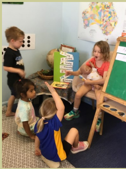
Showing our sense of belonging as we act out being the teacher