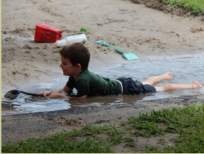
Enjoying the rain before the floods