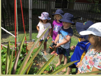
Caring for our sweet potato plants