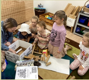
The kindy children and educators worked together to design and make some amazing creations using recycled materials.