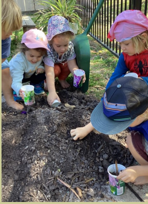
Gathering soil to plant seeds as we reestablish our garden