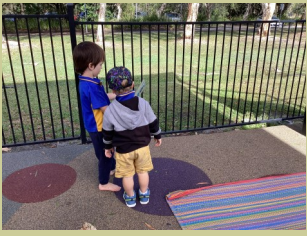
Planning what to build together