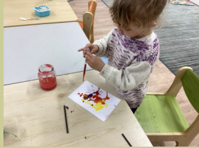
Exploring different ways to work with paint