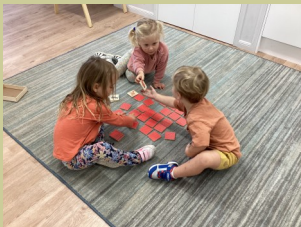
Taking turns as we play games with our friends